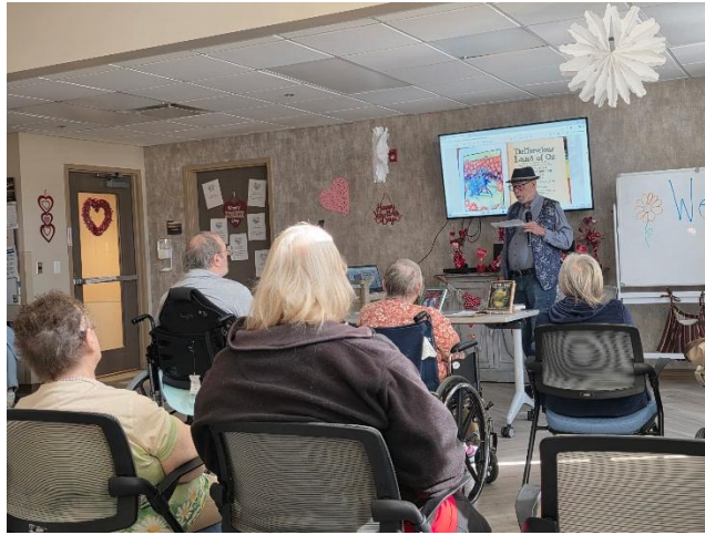
All about the land of Oz talk