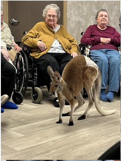
Happy New Year! Fun in January at Rolling Hills