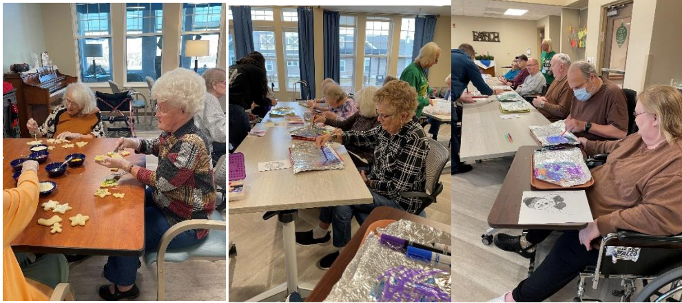
Had fun with some creative artwork