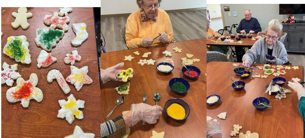
Christmas means time to bake!