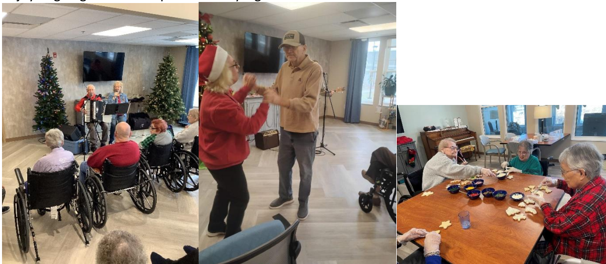
Always enjoy live music and who doesn't like getting up to dance!