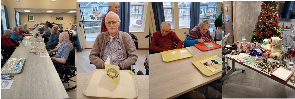
We had lots of visitors and help and gifts this holiday season