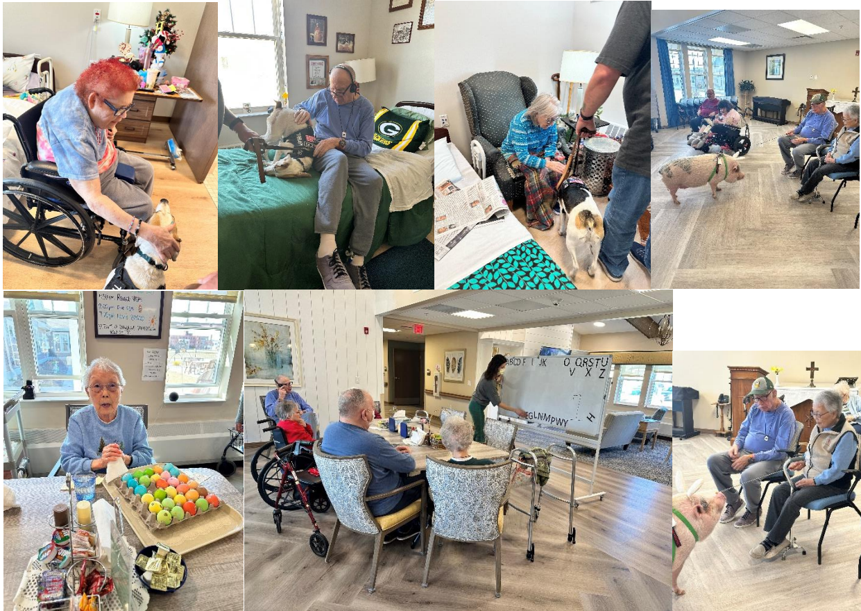
Easter festivities and games as well as a visit from Brutus, our pet pig!