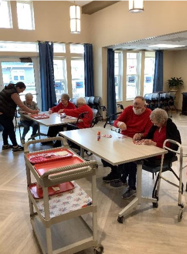
Music and Vintage valentine day