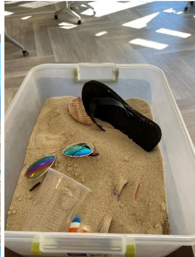
Pauline had fun getting a Beach Party ready for everyone to enjoy!